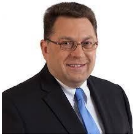
Laurent Wehrli, former Mayor of Montreux, member of the National Council of Switzerland

from 2000 to 2011, which I chaired afterwards.